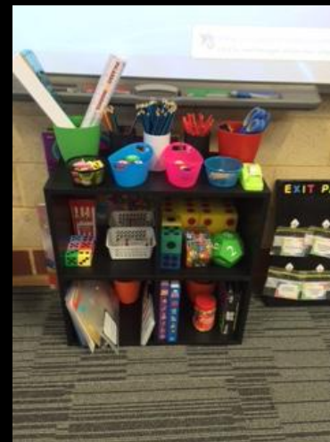
Common Resource Area