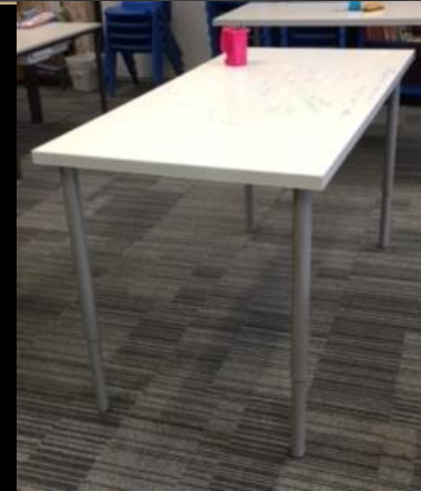
Whiteboard/ Standing tables