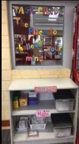
Task Card Area